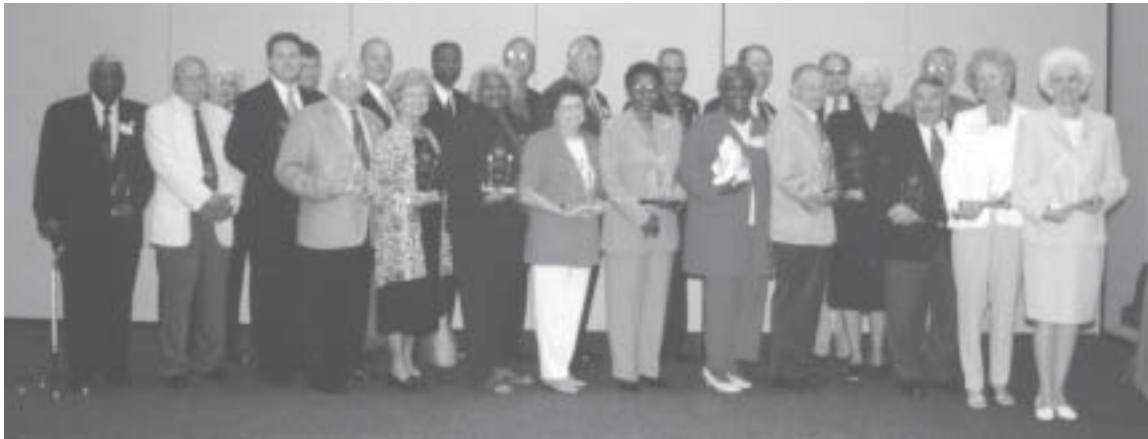
2003 Advanced CMO Graduates