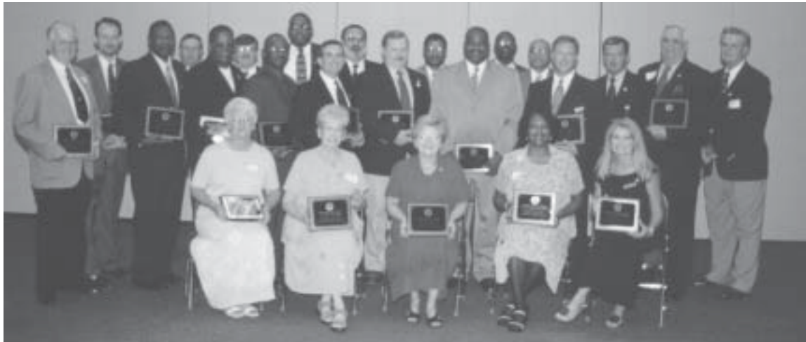
2003 Basic CMO Graduates