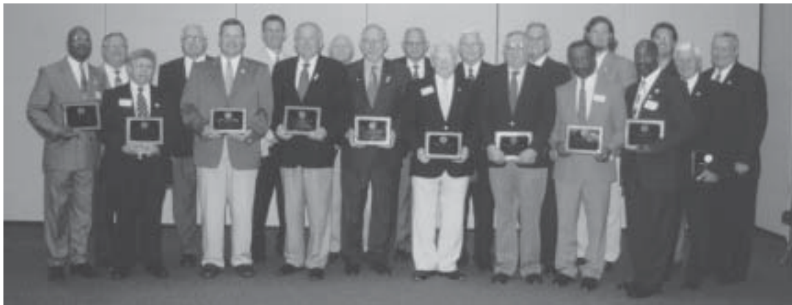
2003 Basic CMO Graduates

Alabama League of Municipalities PO Box 1270 Montgomery, AL 36102 CHANGE SERVICE REQUESTED